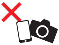
Photo nor video recording inside the buildings